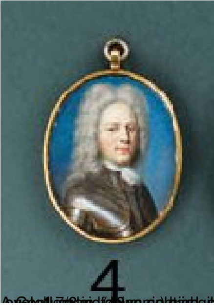
sturdy frame with red leather border, full bottomed powdered wig