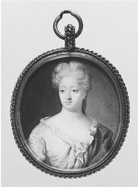
Marie Antoinette (1755-1793), Later Queen of Prussia