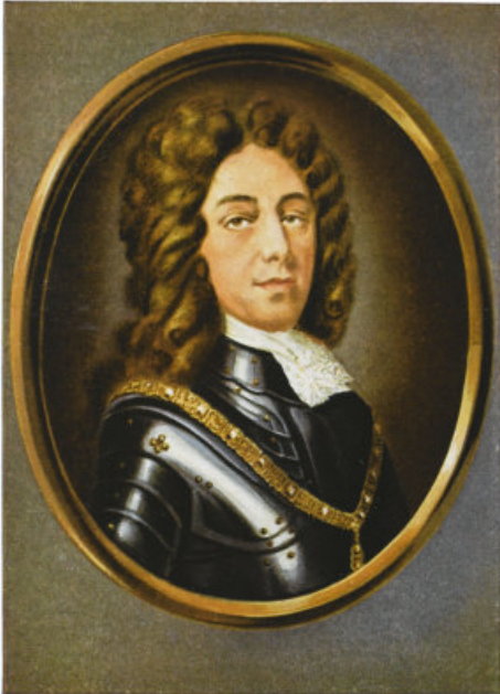
Allegiance of Savoy Military Commander in the Austrian Service Renouncing French