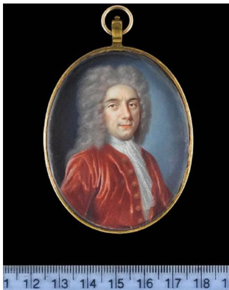
A Gentleman, wearing crimson coat, white lace cravat and powdered wig.