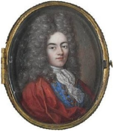
rich red velvet, gold embroidery, white leather border and cravat, red