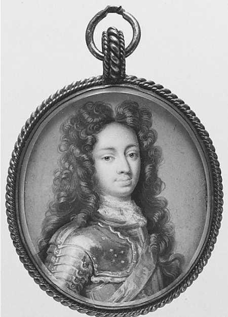
Portrait of Anne, Queen of Great Britain (1665–1714), wearing the Order of the Garter (1689), by Sir Godfrey Kneller, 1689