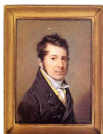
Louis Ami Arlaud-Jurine ( - )